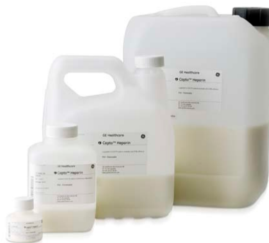
Fig 1. Capto Heparin, which purifies proteins with an affinity for heparin, is available in laboratory and process-scale quantities.

Capto Heparin is based on highly-rigid spherical agarose particles. Agarose is a natural polymer whose hydrophilic properties minimize structural changes of the target molecule and non-specific adsorption to the matrix. The rigid base matrix offers outstanding pressure and flow properties (Fig 3), which are key attributes for cost-effective, large-scale use. Capto Heparin permits a wide working range of flow velocities, bed heights, and sample viscosities, all of which have a positive impact on processing costs. Table 1 lists key characteristics of Capto Heparin.