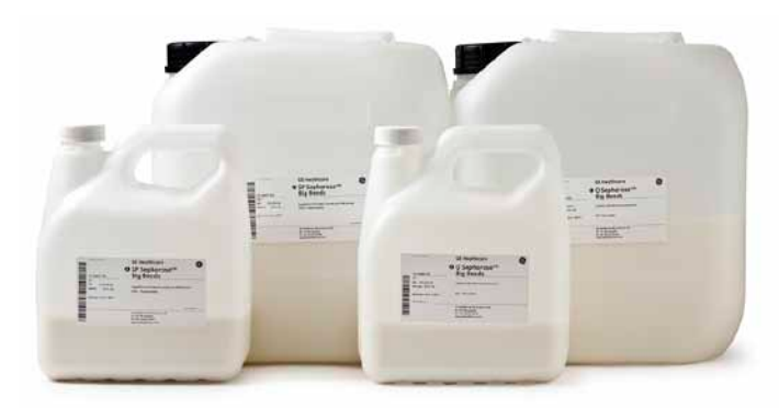
Fig 1. Q and SP Sepharose Big Beads ion exchange media.

Sepharose Big Beads ion exchange media are easy to pack and handle. The very high flow rates that can be used save valuable time in equilibration and during regeneration. Even with viscosities as high as 2.5 times water a high flow rate (500 cm/h) is maintained in industrial column operation. Packed columns can be cleaned- and sanitized-in-place to minimize production losses. The media can also be autoclaved.